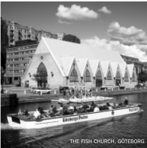
THE FISH CHURCH, GÖTEBORG