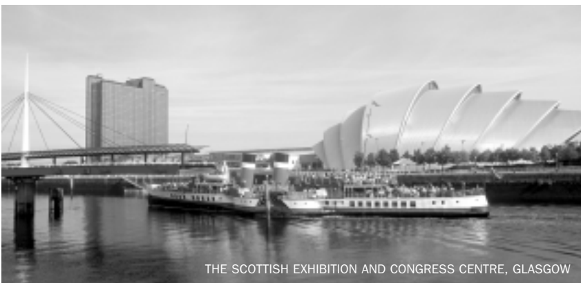
THE SCOTTISH EXHIBITION AND CONGRESS CENTRE, GLASGOW

The preliminary programme will be available shortly at www.ece2006.com