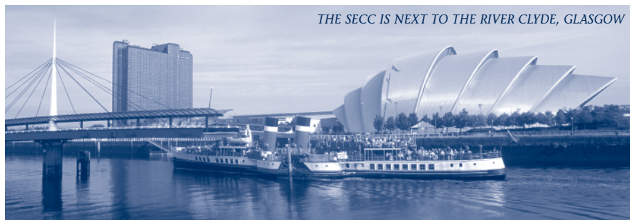
THE SECC IS NEXT TO THE RIVER CLYDE, GLASGOW